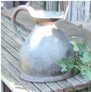
Existing jug and metal sphere are to be incorporated into the design as an 'old' element to contrast with the modern design