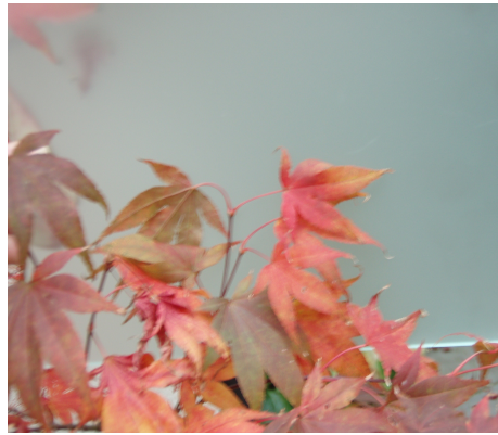
Pale, semi-transparent acrylic screens contrast well with Acers, which turn coppery red in the autumn. The modern material also contrasts with the stone paving.

This is a modern, contemporary design linking into the modern interiors via the kitchen flooring and interior colour scheme. The paving, although an old material, is cut and laid in a modern way - sawn straight edges and lines with tight joints. Acrylic screens are also very modern and give a semi-transparent screening to planting behind - an air of mystery and intrigue is gained. The screens are a fabulous backdrop to the Acers planted in front of them, providing a strong contrasting focal point which is then repeated throughout the garden.