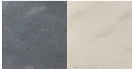
Contrast between dark, riven slate and light, sawn limestone