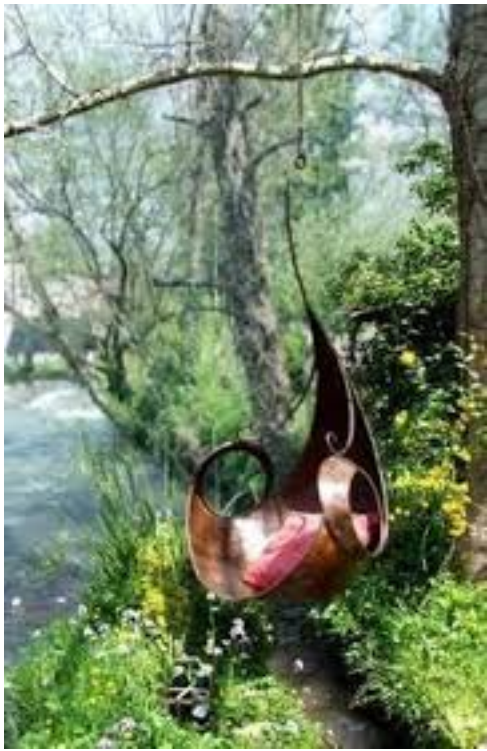
The copper of the Lily Swing at the end of the garden links with the pergola caps and the copper water feature, which is to be designed and installed by Stephen Myburgh.

Stepping out from the kitchen onto a landing platform, the view across the garden displays three main areas linked by two smaller pathways. The first patio is designated to outdoor eating, the next for Wing Chun practice, and the last area is for enjoying the late evening sunshine. The incorporation of Prunus serrula at the end of the garden mirrors the soft curves of the Oak tree and links well into the parkland beyond.