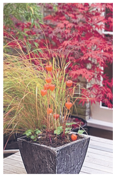
Above: a container of pheasants' tail grass and Chinese lanterns, to be followed by cyclamen, brightens the bare patio table

garden's quota of autumn colour, she chooses climbers that are more than a one-season wonder: evergreen jasmine with leaves that take on burnished red tints come September; a Virginia creeper that clothes a trellis on the back fence. "It's in shade, so it turns a rich orange rather than the deep red it