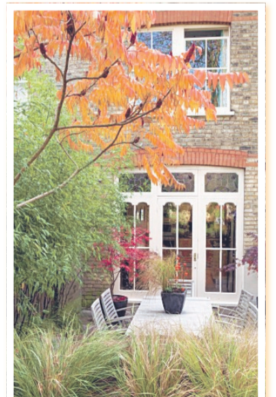
A sumach tree acts as a screen and provides vibrant foliage and fruits

"And there is a vicarious thrill in sitting on the bench at the end of the garden when the wind's blowing, because you never know if a falling conker is going to hit you or not."